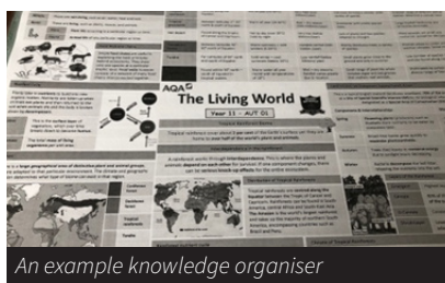
An example knowledge organiser

All Knowledge Organisers have been placed into folders for every student as below. Your child is expected to bring the folders to school every day. They have also been issued with a self-quizzing book which accompanies the folder.