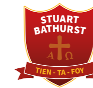
Stuart Bathurst High School