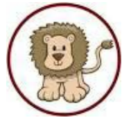
St. Mark's Primary School