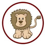
St. Mark's Primary School